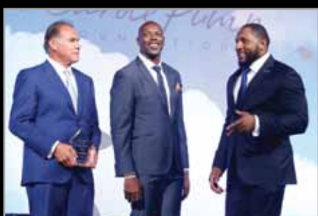
Jim Plunkett, Terrell Owens & Ray Lewis