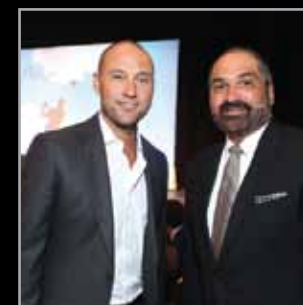
Derek Jeter & Franco Harris