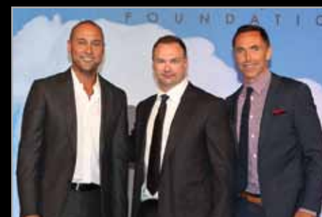
Derek Jeter, Thomas Tull & Steve Nash