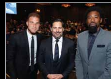
Blake Griffin, Joe Manganiello & DeAndre Jordan