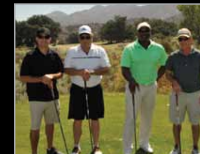
Bo Jackson & Golfers