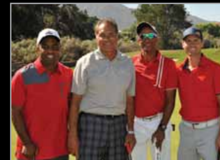
Jim Plunkett & Golfers