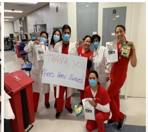
Feed Hero Nurses

Thank you for providing lunch two days in a row, totaling 144 pizzas for our staff to enjoy! Many thanks to you!